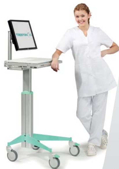
A mobile workstation by Treston

Treston Group has used Manner castors successfully in the products of its Treston and Sovella brands. The vast range of high-quality castor products makes it easy to find a suitable castor for every application. Therefore, Manner products perfectly meet the challenges set by Treston's extensive product range and high quality level. Our cooperation has been smooth for years.