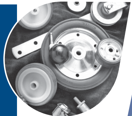
Castor products from the 1960s

Plastic castors have been manufactured by Manner since the 1960s. The first injection moulding machines for the manufacture of plastic castors were purchased in 1966. Since 1974, castors have been Manner's only product line and first marketed to all Nordic countries.