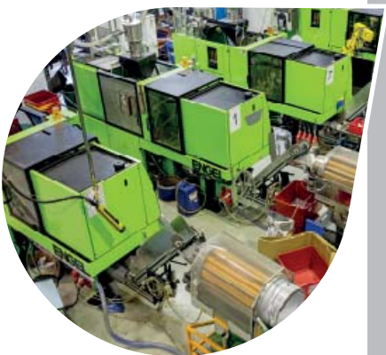
Modern production facilities

Major investments have been made in product development while customer-orientation gains in importance – castors are designed in response to customer needs. The importance of attractive design is also increasing. Manner's long history and experience from working metal and plastic combined with active R&D efforts and top expertise have made Manner an internationally known and highly-valued castor brand.