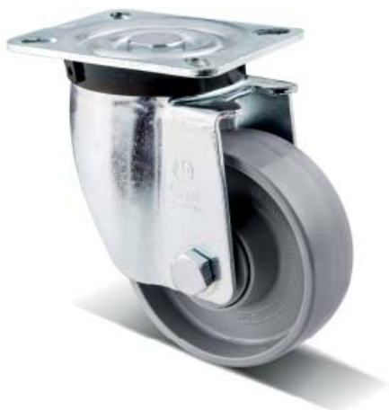
LSE-100/52 N/K L

The options are swivel castor, swivel castor with brake and fixed castor. The tread alternatives are polyamide, polyurethane, soft cast urethane and elastic solid-rubber; the center is polyamide.