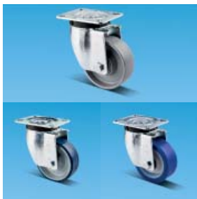
Top LSE-100/52 N/K L Bottom on the left LSE-100/52 ND/K L, on the right LSE-100/52 AS/K L