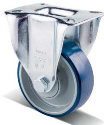
LPSE-100/52 ND/K L