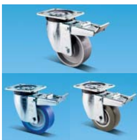
Top LSE-J-100/52 N/K L Bottom on the left LSE-J-100/52 AS/K L, on the right LSE-J-100/52 NEK/K L