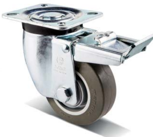
LSE-J-100/52 NEK/K L