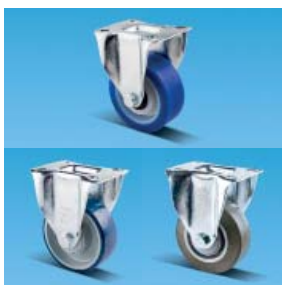
Top LPSE-100/52 AS/K L Bottom on the left LPSE-100/52 ND/K L, on the right LPSE-100/52 NEK/K L